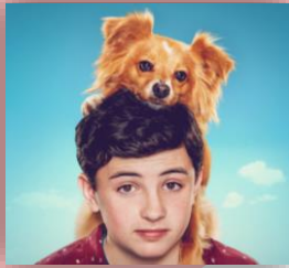
The Healing Powers of Dude Available on Netflix