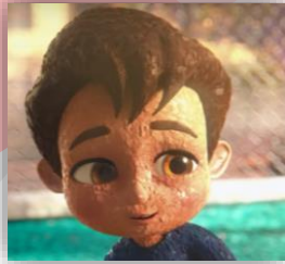
Ian Click here to view