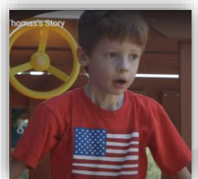
Thomas's Story Click here to view