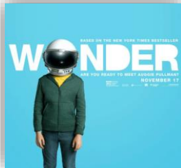
Wonder Available on Netflix