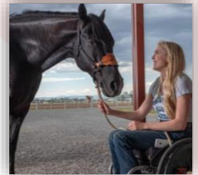
Walk. Ride. Rodeo Available on Netflix