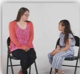
Kids Meet Woman with Down Syndrome Click here to view