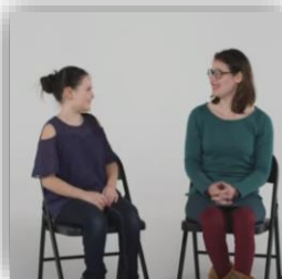
Kids Meet Woman with Cerebral Palsy Click here to view