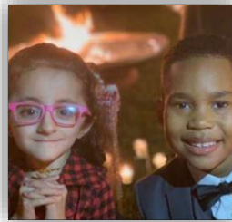
Raising Dion Available on Netflix